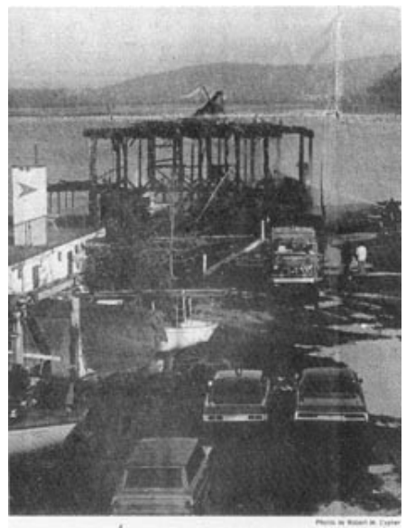
Only beams remained before the hulldozer came him 30 him

He estimated the flames were shooting some 50 feet above the roof and said the inferno was so hot his men couldn't get very close with their hoses. The intense heat melted one fire trucks taillight lenses.